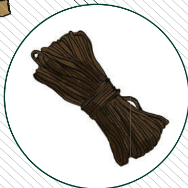
6. 30 metres of dark coloured communication cord