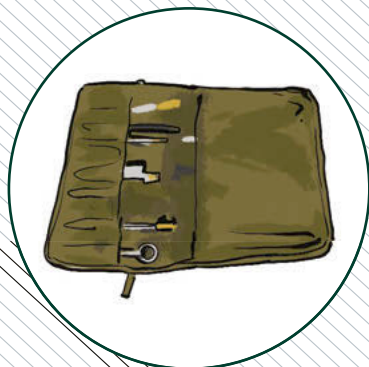
5. Rifle cleaning kit