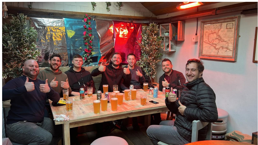
Members of the 1 st XV sheltering after poor weather postponed Heaton Moor Away forcing them to take refuge in local Ale House, Shipwrecked.