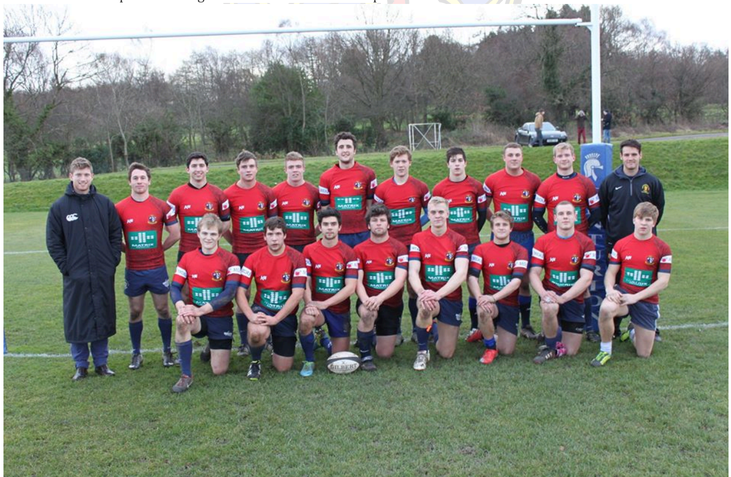
1st XV vs Ripon - 14/12/13