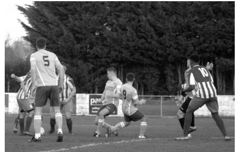
Woodley United defending in numbers