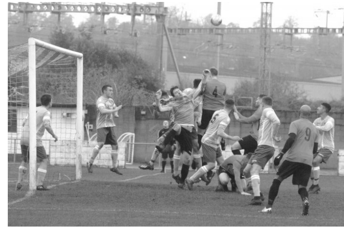
United defending a Wokingham & Emmbrook corner kick