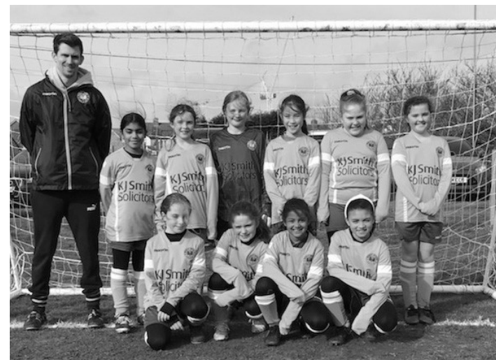
Woodley United u10 girls at Shinfield Rangers

Last Saturday saw a squad of u10 girls from our weekly Saturday morning girls' sessions travel to Shinfield Rangers for a game. This was the first of successive weeks of matches for the girls with two squads taking part in a seven a side festival at Slough this Saturday 29 th followed by three weeks of matches against local teams.