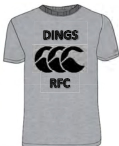
Prints available in black & navy