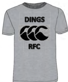
Prints available in black & navy