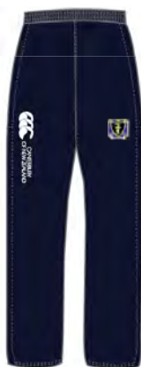
O/H Stadium Pants