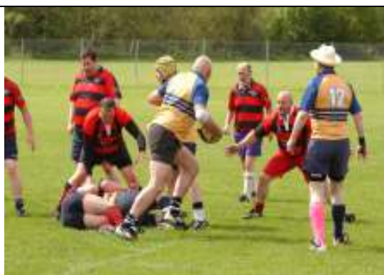
Different Headgear Fashions...