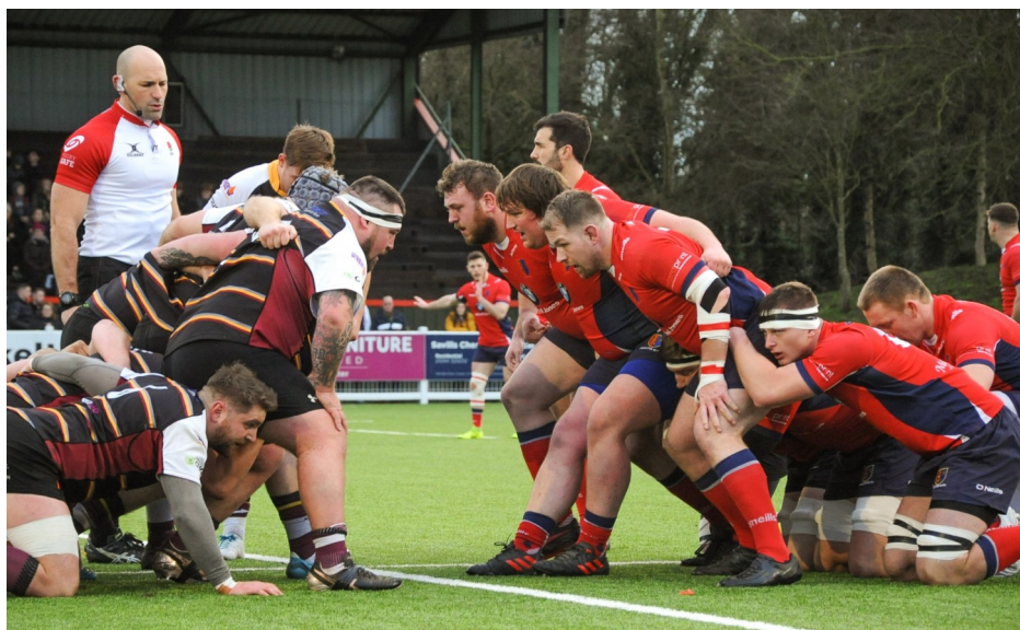
Power packs: The front rows become acquainted during Chester's last home game against Caldý.