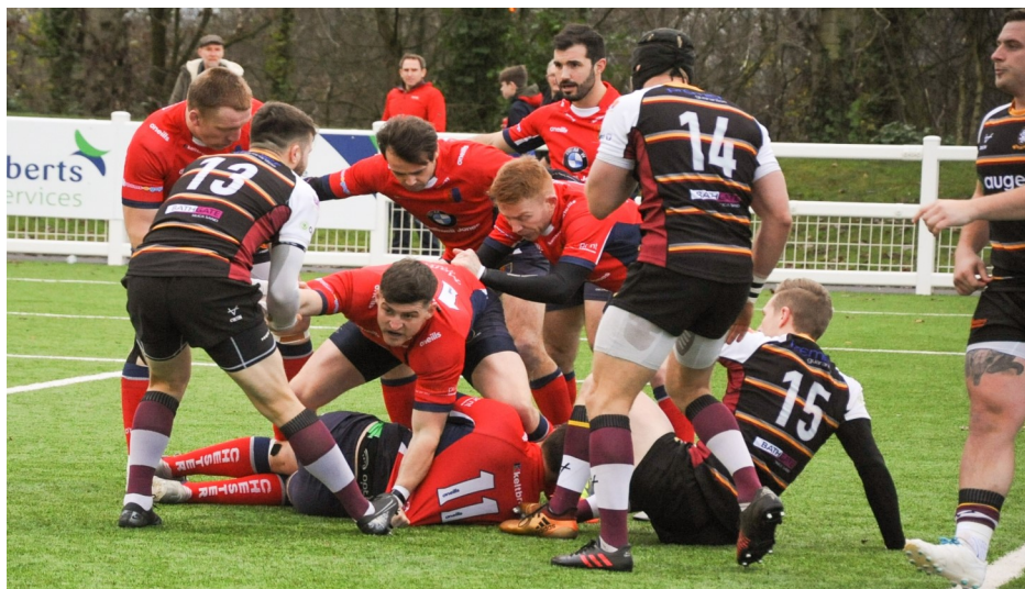
Back burners: The three-quarters of both sides emulate their forward colleagues as they compete for the ball.