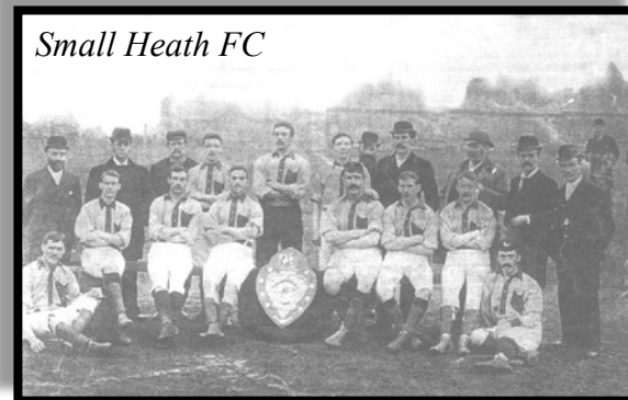
Small Heath FC