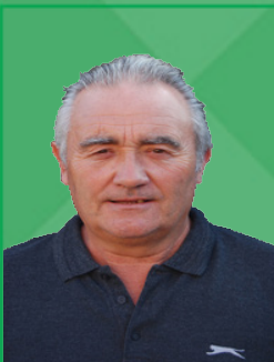
Sponsored by Belton Bros Ltd