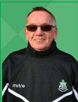
Sponsored By David Patient