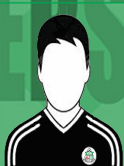
Available To Sponsor