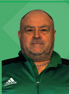
Available To Sponsor