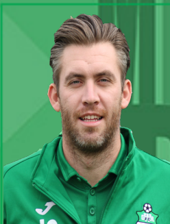
Sponsored by Roy Ketteridge