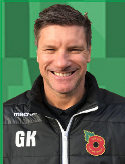
Available To Sponsor