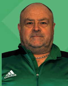
Available To Sponsor