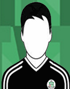
Available To Sponsor