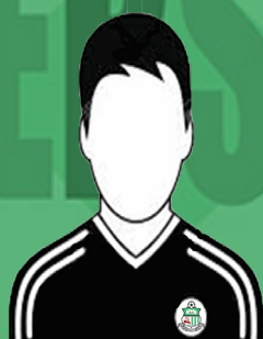
Available To Sponsor