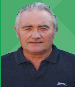
Sponsored by Belton Bros Ltd