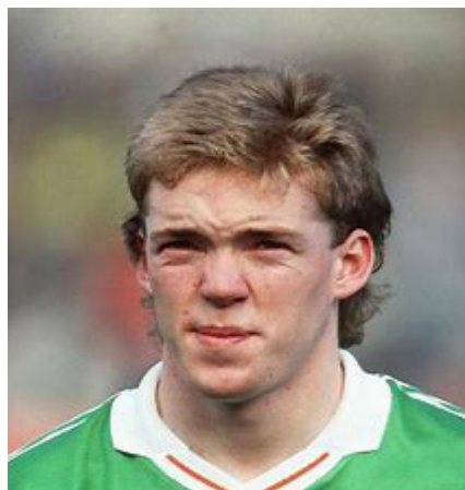
Stephen Staunton (born 19 January 1969)

Stephen Staunton is an Irish association football manager and former professional footballer who played as a defender. He earned 102 caps for the Republic of Ireland national football team, captained his team to the knock-out stage of the 2002 FIFA World Cup and earned his place in the FIFA Century Club.