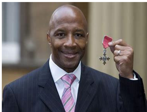
Cyrille Regis, MBE (9 February 1958 – 14 January 2018)

Cryille was an English international footballer who played as a forward. His professional playing career spanned 19 years, where he made 614 league appearances and scored 158 league goals, most prolifically at West Bromwich Albion and Coventry City. Regis also won five caps with the England national team.