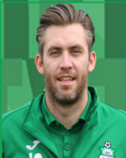
Sponsored by Roy Ketteridge