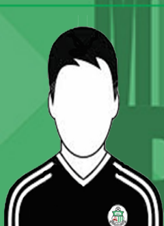
Available To Sponsor