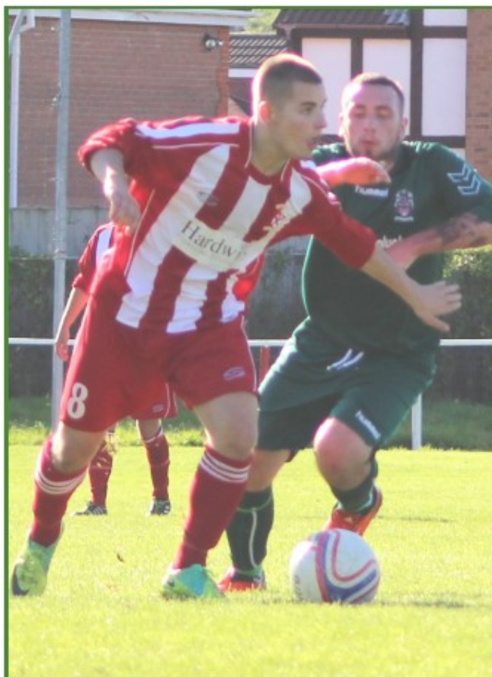
Ashton Town AFC v Cheadle Town FC 14/9/13 more photos are available on our website www.ashtontownafc.co.uk