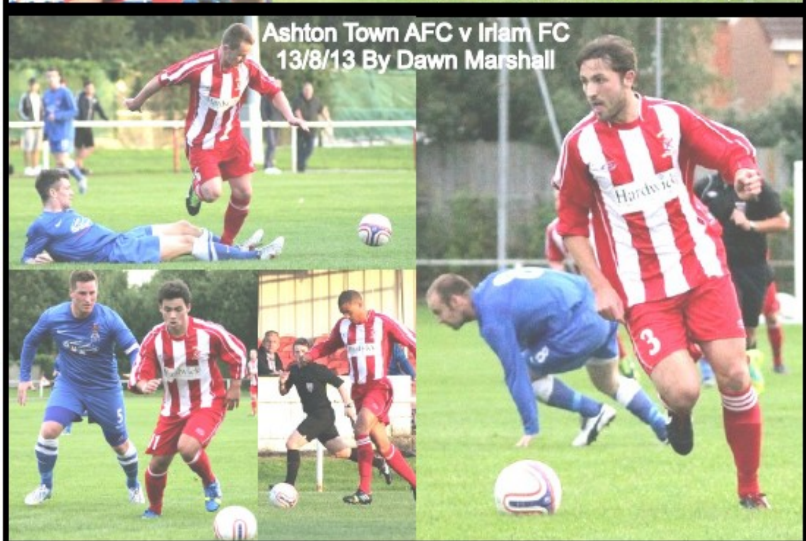
Ashton Town AFC v Irlam FC 13/8/13 By Dawn Marshall