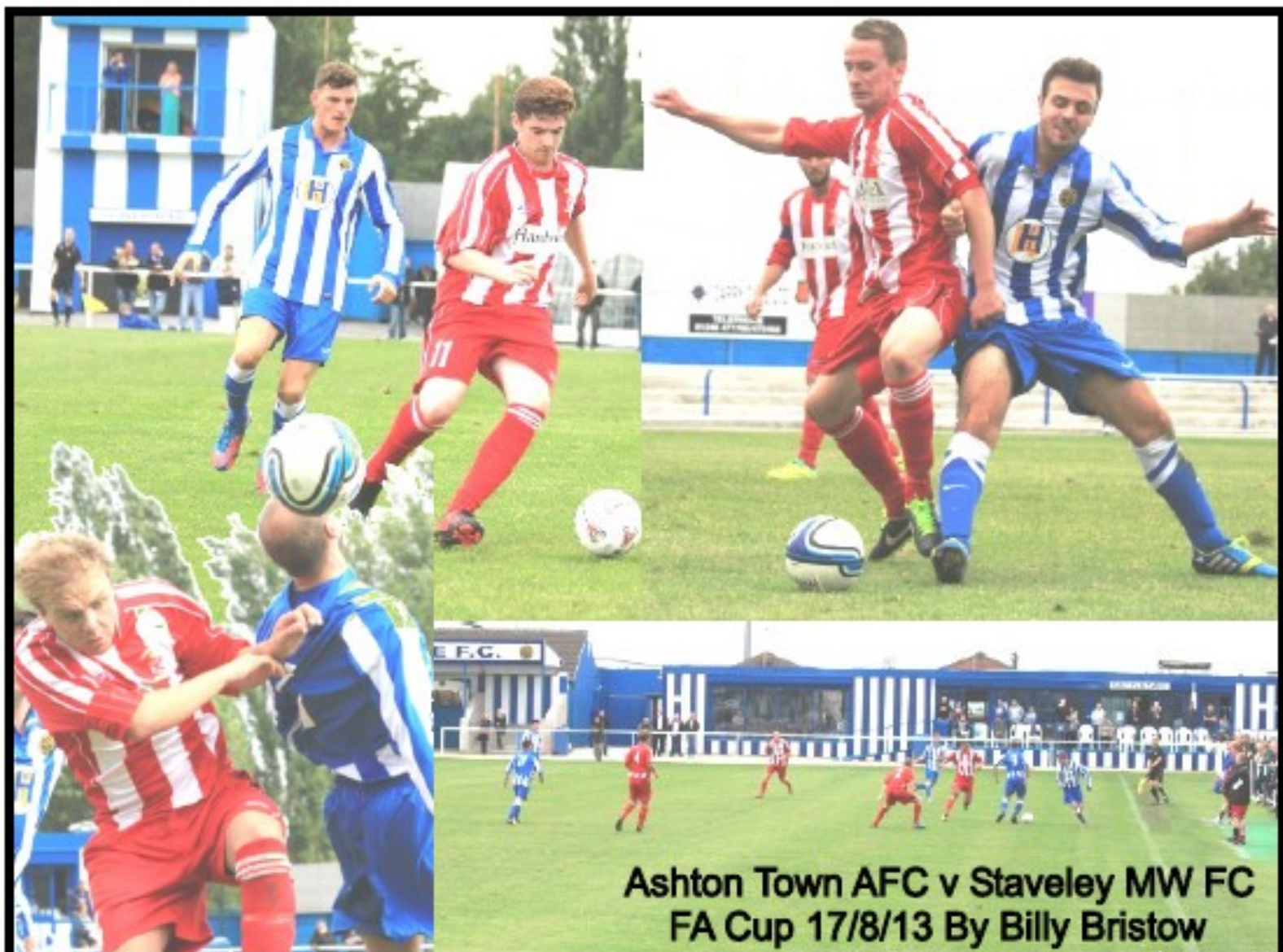
Ashton Town AFC v Staveley MW FC FA Cup 17/8/13