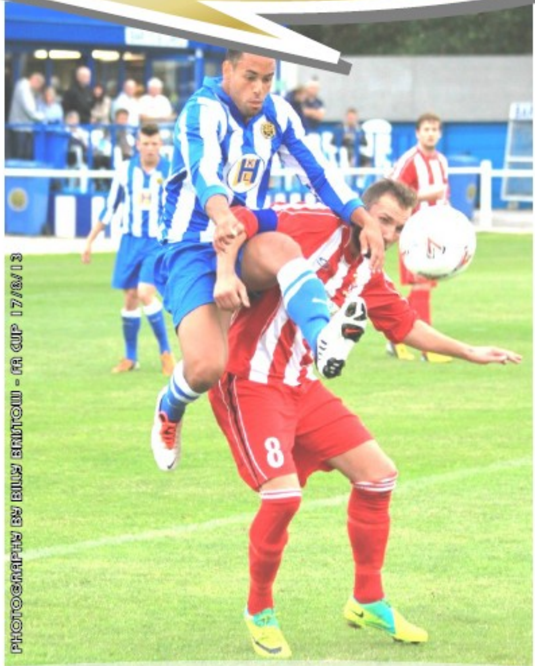
FA CUP 17/8/13