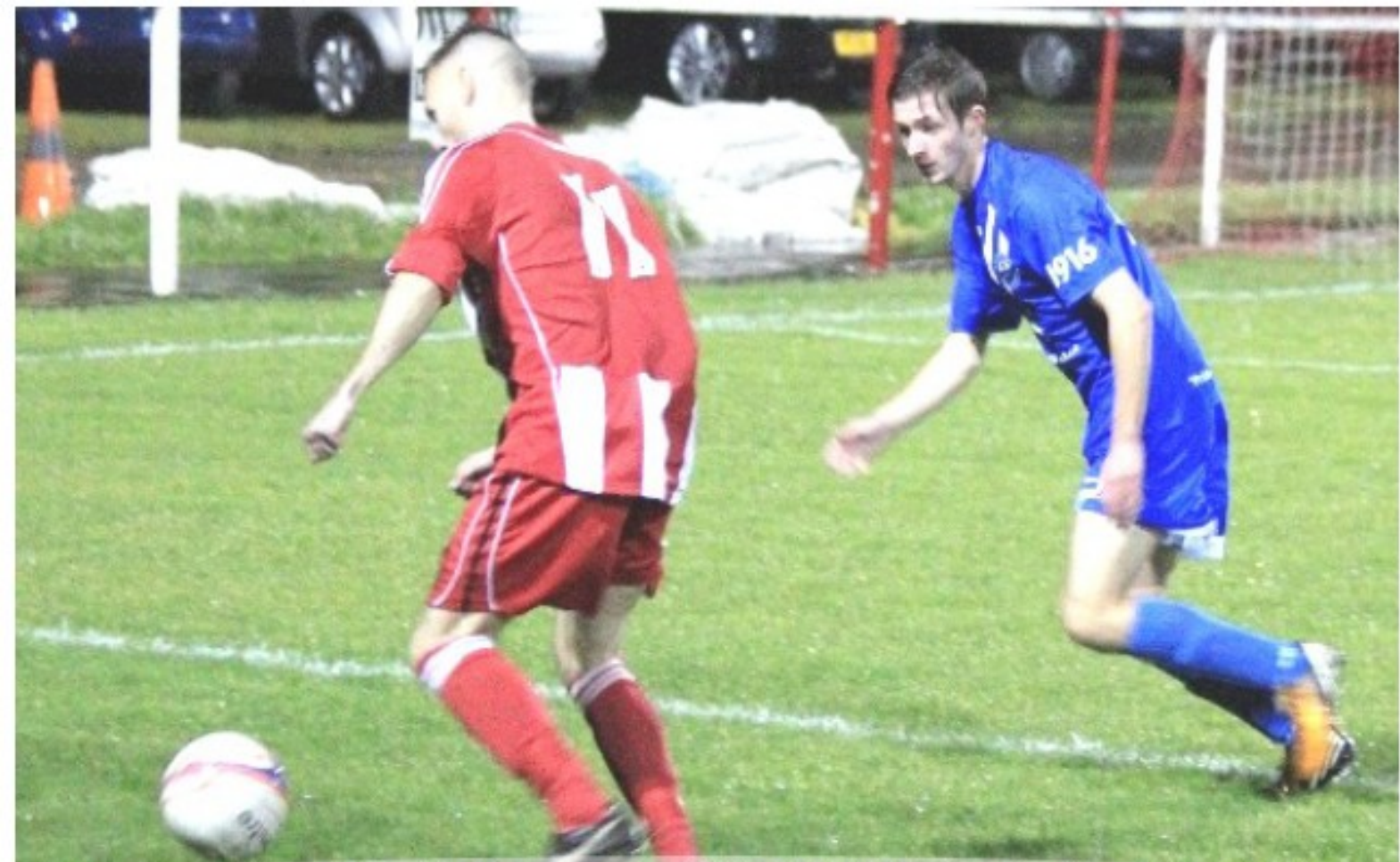
Atherton Colls FC v Ashton Town AFC 29/10/13 more photos are available on our website www.ashtontownafc.co.uk