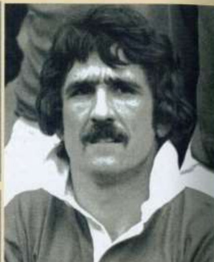
Gerald Davies skippered Cardiff in their 29-25 defeat by Argentina.