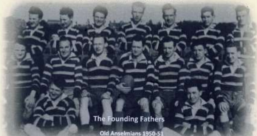
The Founding Fathers