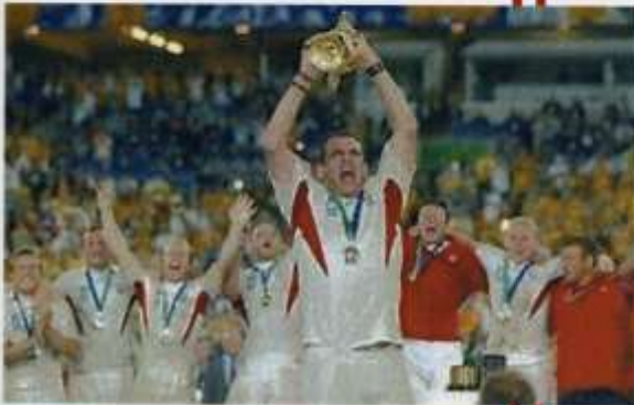
England v Australia 2003 World Cup Final