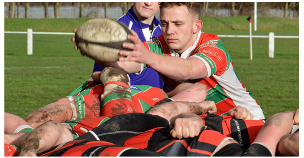
“Let’s see if I can drop the ball in between the hooker and the prop.”