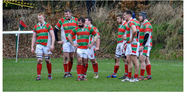
“Well, if that’s your attitude, I’m off”