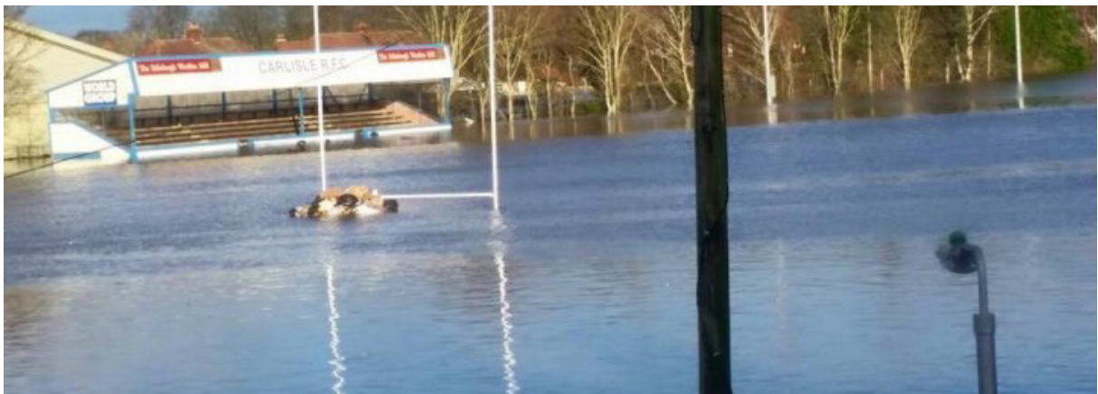
Carlisle’s ground immediately after the flood

Warrington is not a rich club but we have decided to donate half of today’s gate money to Carlisle to help them in their current crisis. It’s not much, but it is a gesture to show that we are all in this together.