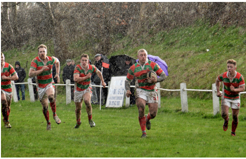
“Where’s everybody gone?”