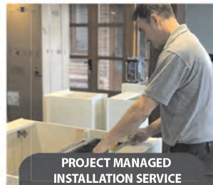
PROJECT MANAGED INSTALLATION SERVICE