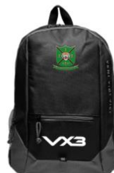
Plymouth Argaum Core Backpack £18.00