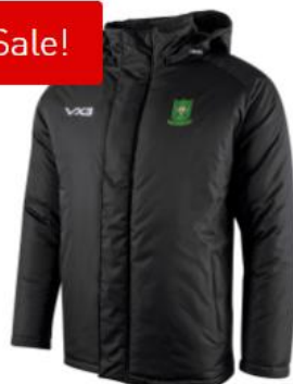
Plymouth Argaum Pro Corporate Jacket £53.00 £23.00