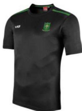
Plymouth Argaum Fortis Tee £17.00