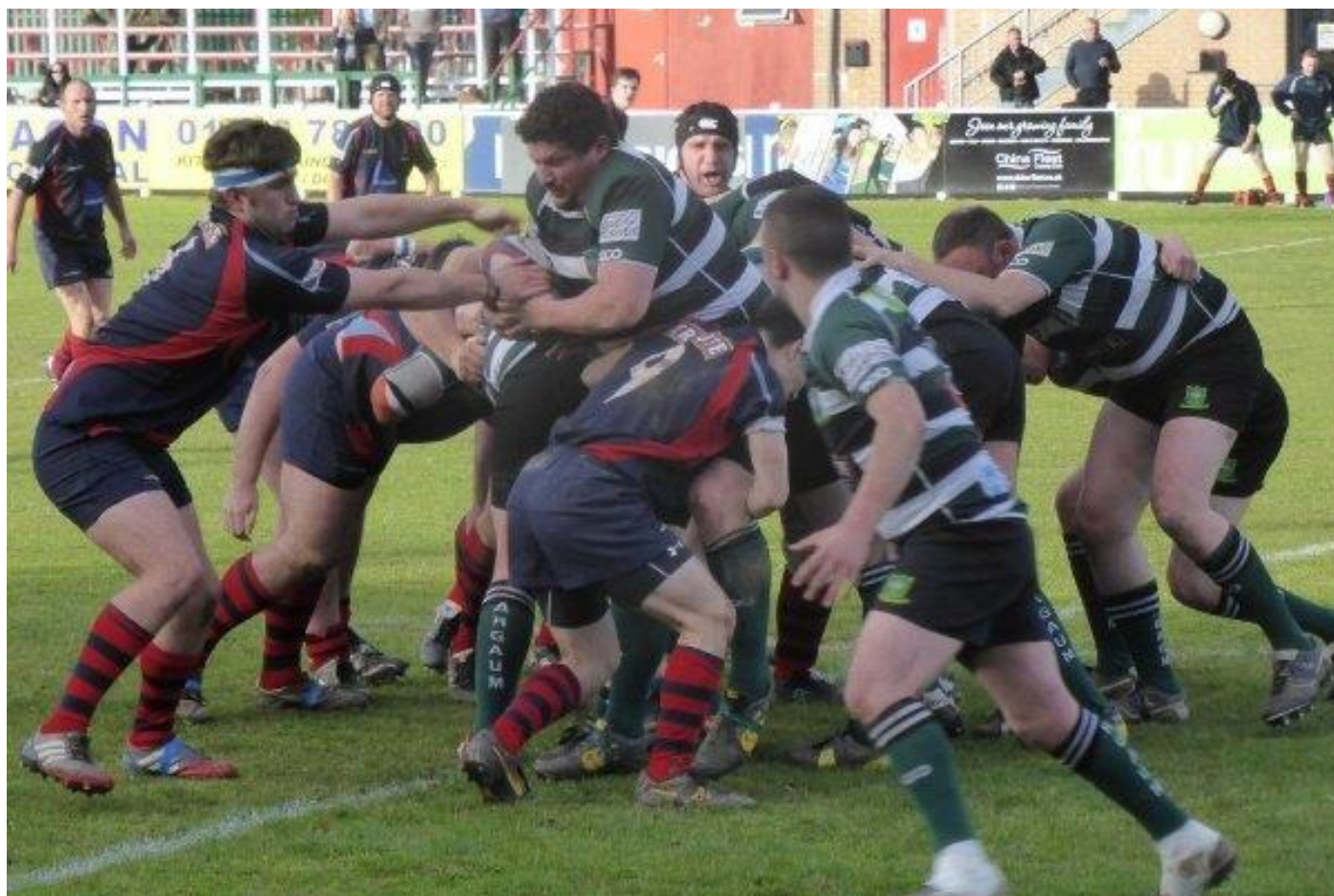
Action from the 2013-14 Ellis Cup Final

Plymouth Argaum and Devonport Services have a long history in the cup, meeting regularly in both Combination and County Cup competitions. Argaum's first victory in the Lockie Cup in 1923-24 came at the expense of Devonport Services 'A'. The last time the Wanderers met Services III in the Ellis Cup was in the final itself in 2013-14 where the 'Sporting Blues' ran out winners by 16 points to 3 at Brickfields.