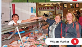
Wigan Market 5

*Open to the public at weekends and after 6pm on weekdays