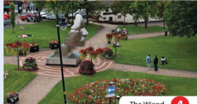
The Wind 4