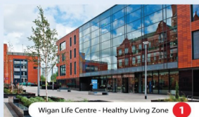
Wigan Life Centre - Healthy Living Zone 1