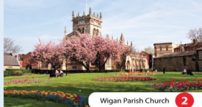
Wigan Parish Church 2