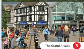
The Grand Arcade 3