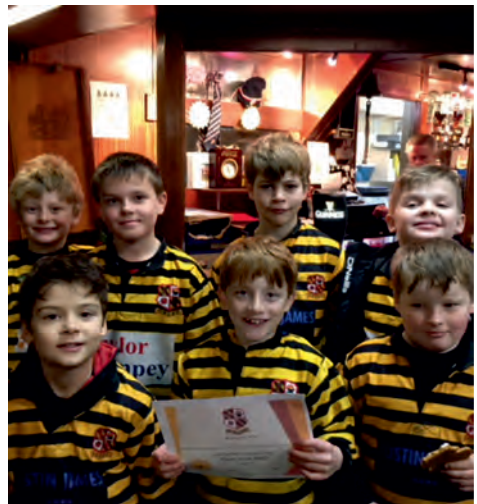
Pictured are the Orrell Under 9s after the games refreshments with man of the match positioned centre.

A well-deserved victory today Orrell, may this continue into next week's home game with Leigh.