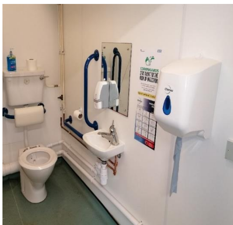
Soap Dispensers & blue hand towel dispensers