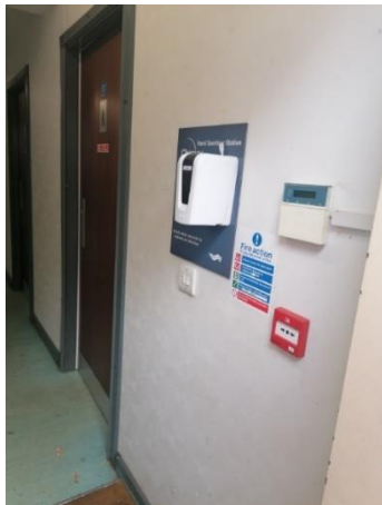
Sanitising station on the inside of the door