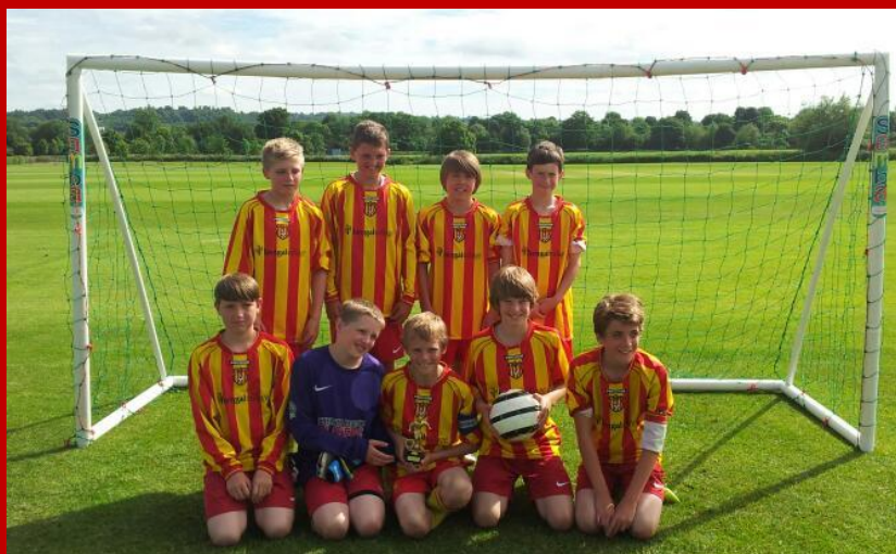
U11's with the Trophy at Tonbridge School

The U11's continued where they left off last summer. After winning two tournaments last year they quickly got off the mark again this year by winning the Ockley Acorns Tournament at the end of April without conceding a single goal.