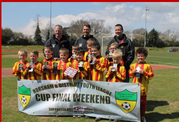
The U8's celebrating with their awards