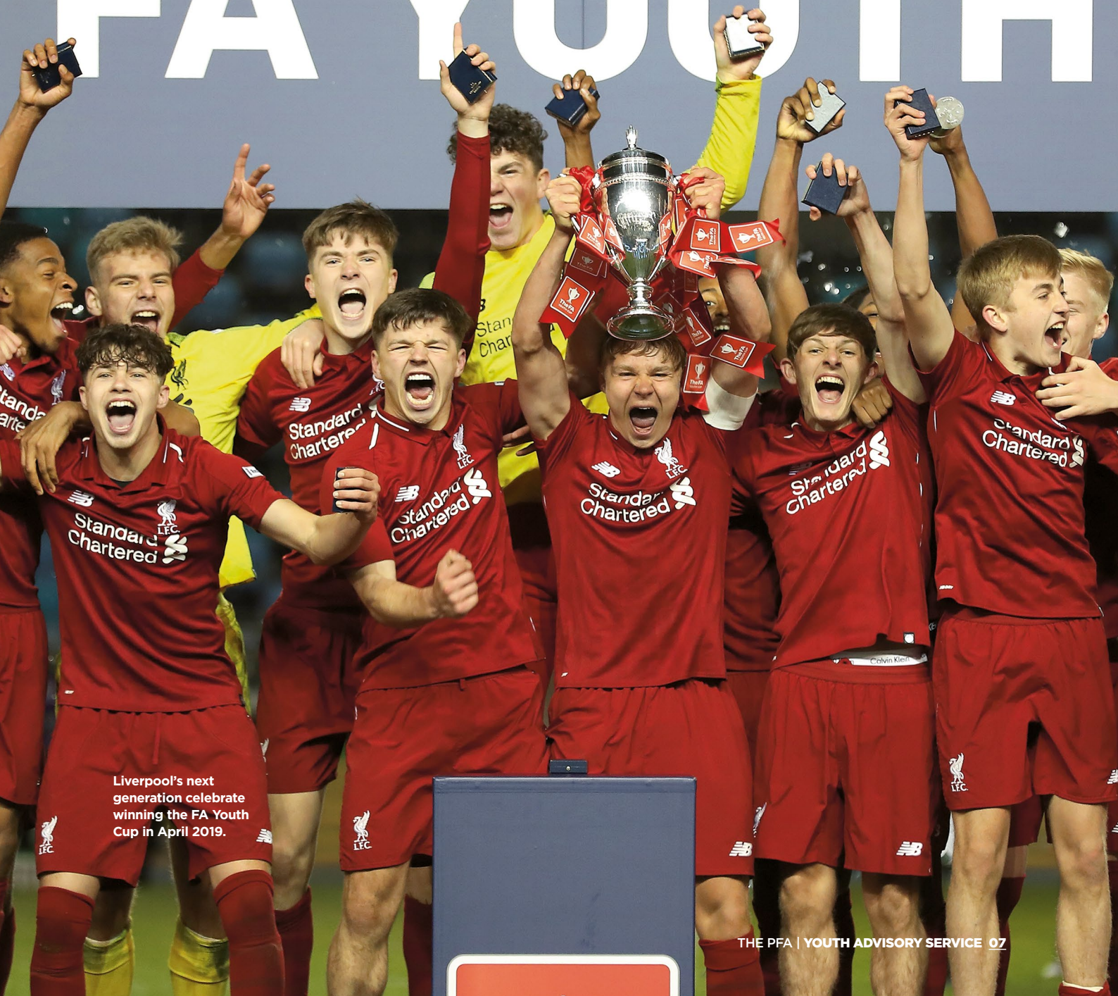
Liverpool's next generation celebrate winning the FA Youth Cup in April 2019.