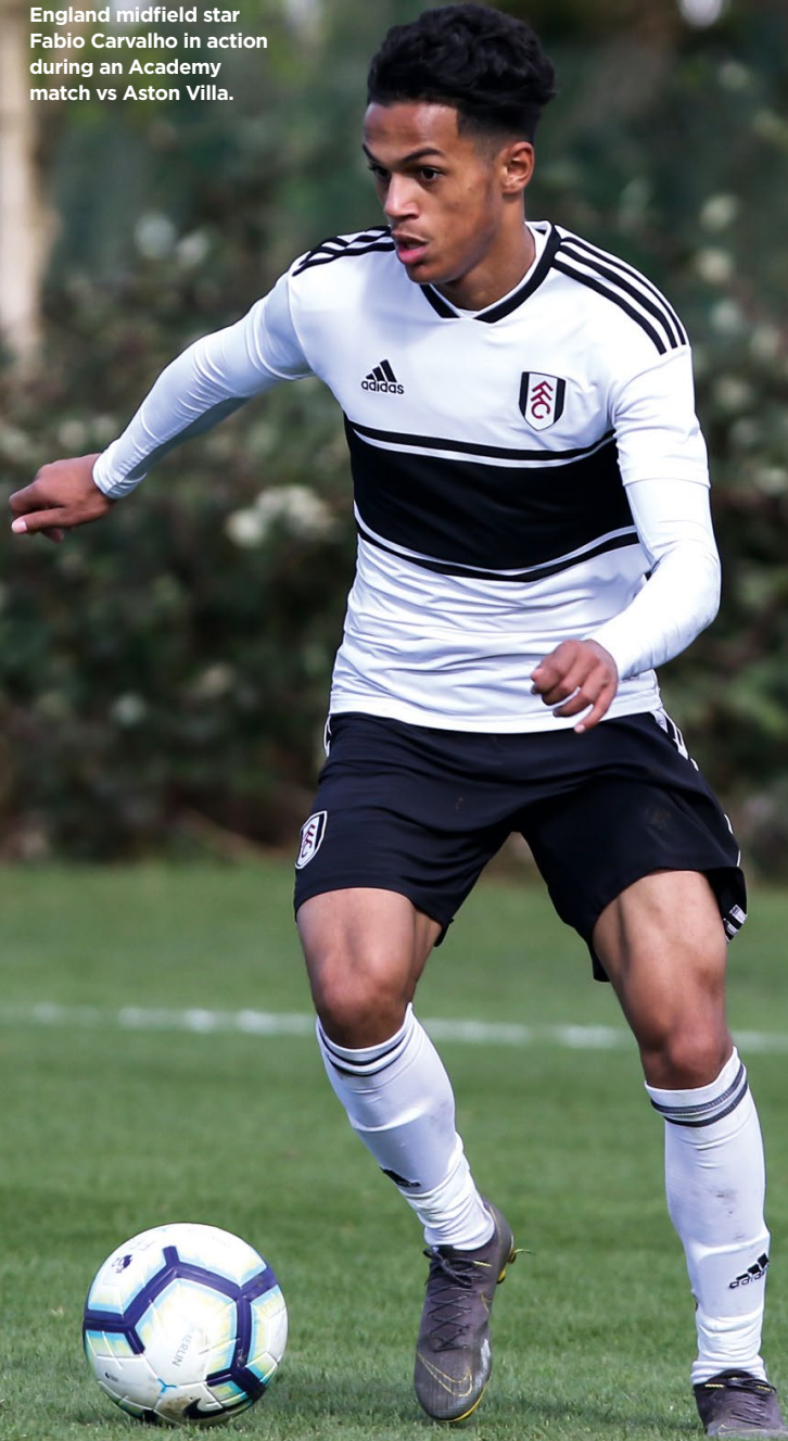
16-year-old Fulham and England midfielder star Fabio Carvalho in action during an Academy match vs Aston Villa.