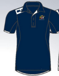
NAVY TEK VI POLO