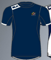
NAVY TEK VI TEE