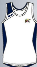
WHITE TEK VI SINGLET