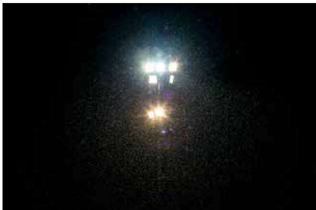
Snow falling over Haywood Way tuesday.