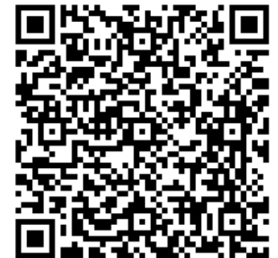
Magic Touch Dry Cleaners 65a, High St, Haverhill