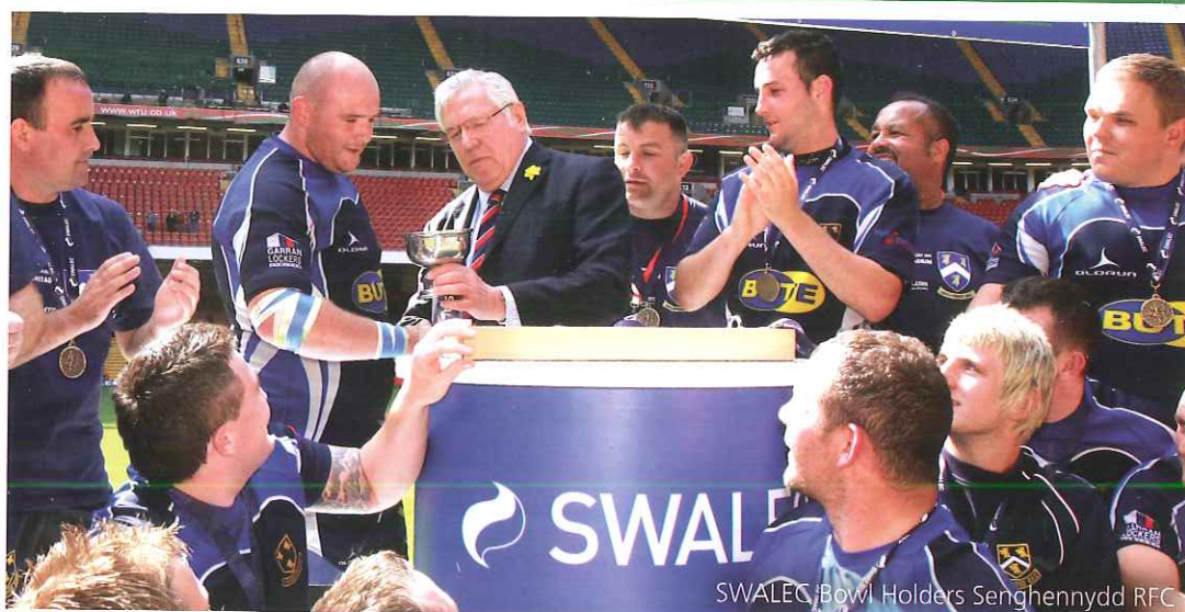
SWALEC Bowl Holders Senghennydd RFC

THE WAIT is almost over for six teams that are 80 minutes away from Millennium Stadium glory.