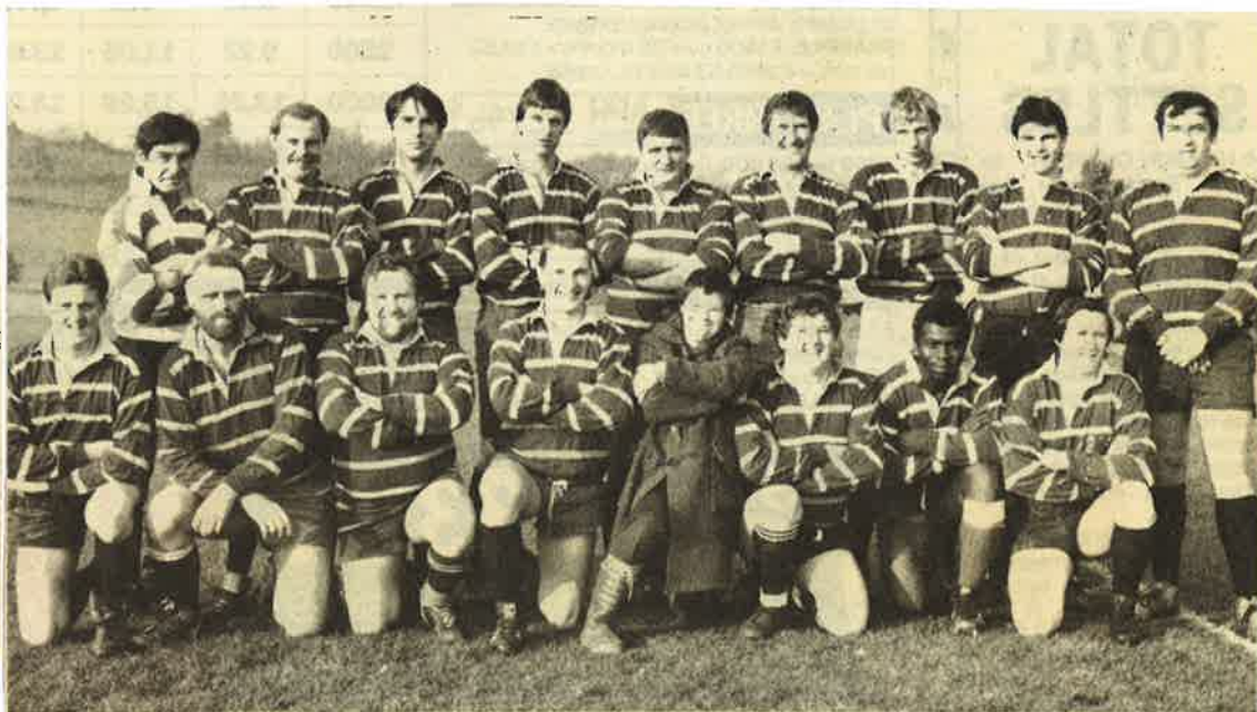
Newcastle R.U.F.C. 2nd XV who won 8-7 away to Leek 2nd XV.