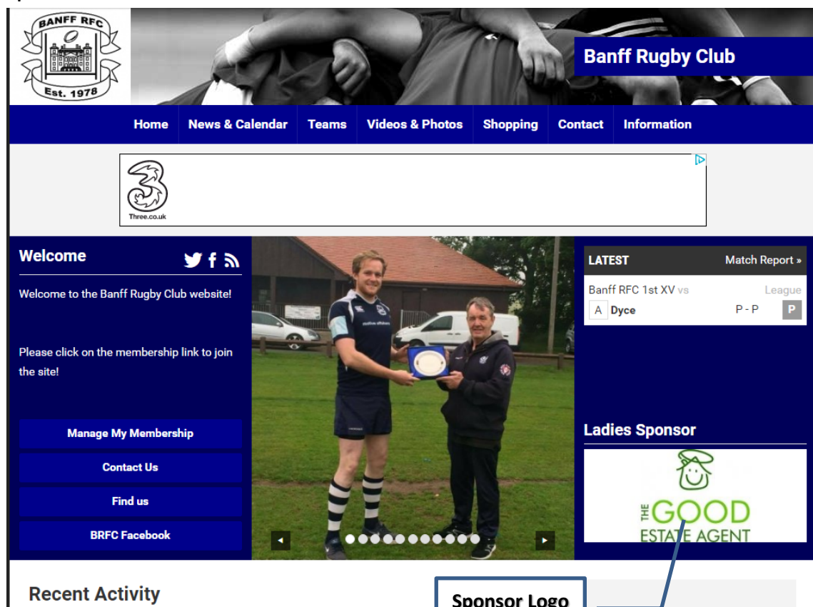
Figure 2: Banff website