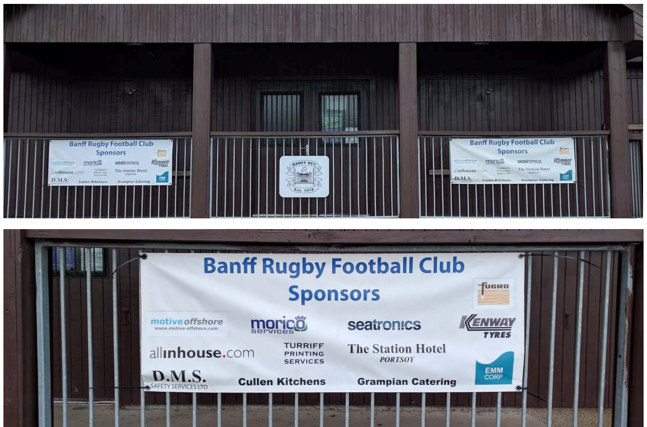
Figure 1:Sponsors Banner