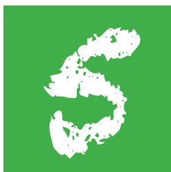
Timperley Badgers Year 10