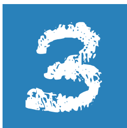
Northop Hall Year 10