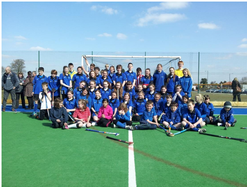
WELCOME TO THE 2013 – 14 SEASON AT TIMPERLEY HOCKEY ACADEMY