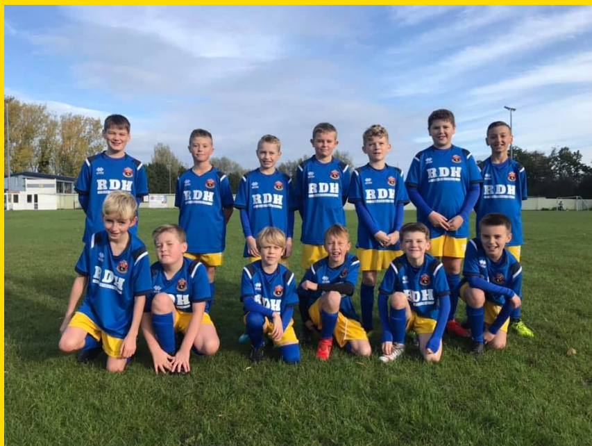
AFC Sudbury U11 (2019-20)

AFC Sudbury U11s are delighted with their new away kit, kindly sponsored by RDH Construction.