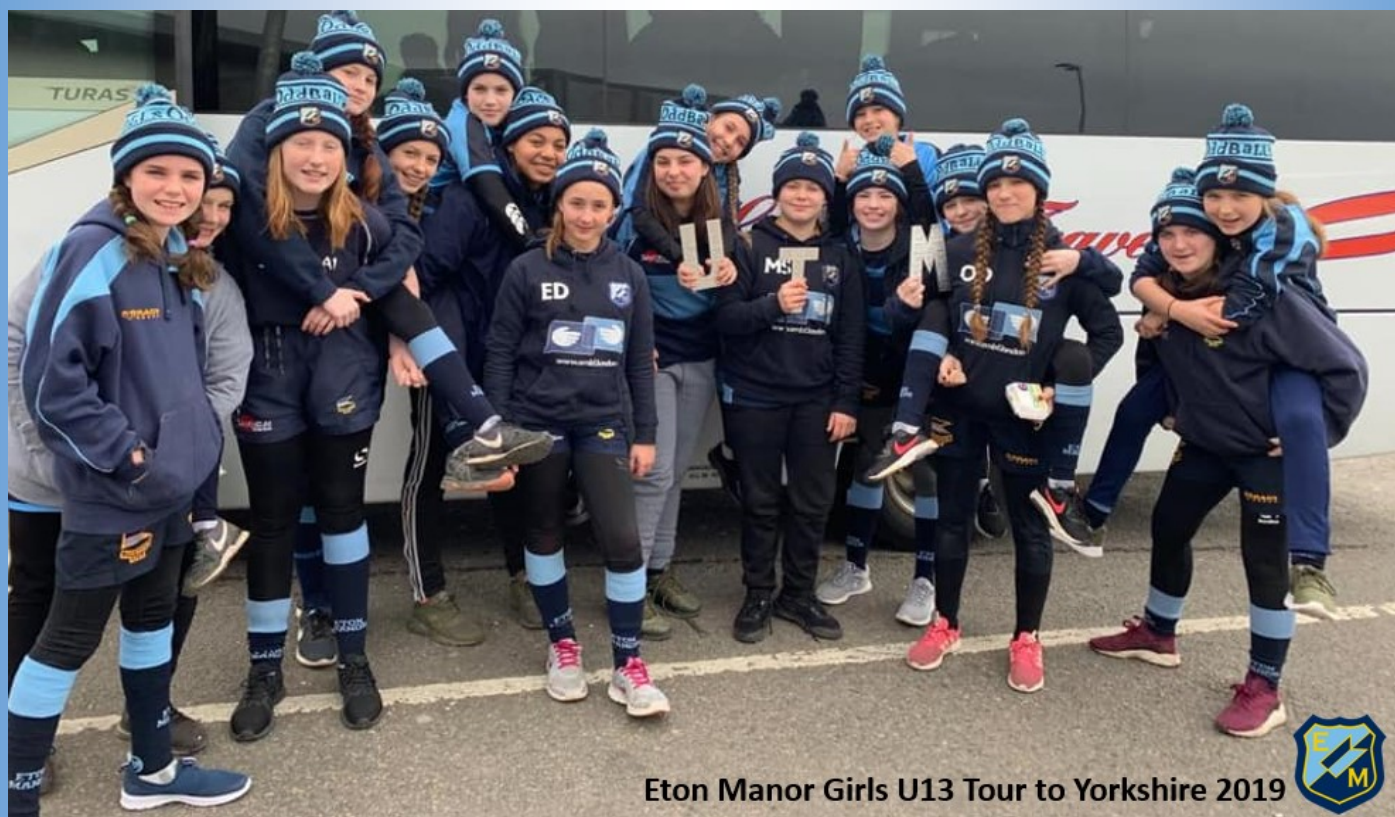
Eton Manor Girls U13 Tour to Yorkshire 2019

This kind of generous investment is perfect for our senior development sides, vets and particularly our Youth & Minis teams of all ages.