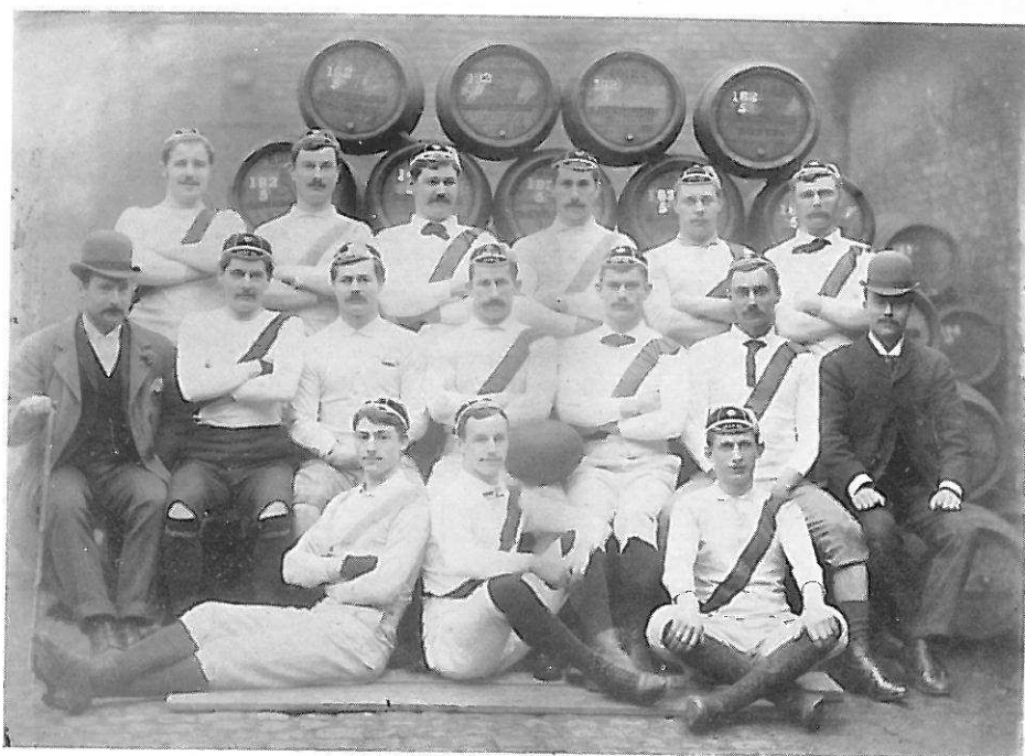
BURTON FOOTBALL TEAM. SEASON 1887-8 WINNERS OF THE MIDLAND COUNTIES CHALLENGE CUP