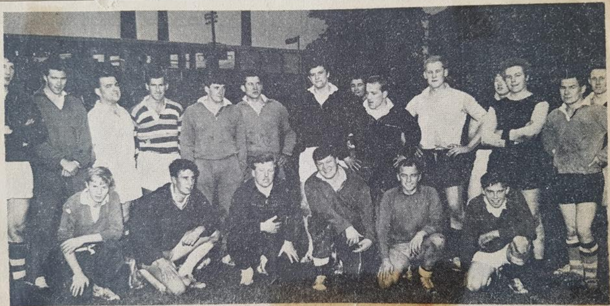
BURTON RUGBY CLUB are now getting down to serious training for the rapidly approaching 1966-67 season, and the above picture captures some of the players during one of the quieter moments in last night's training session on Peel Croft.