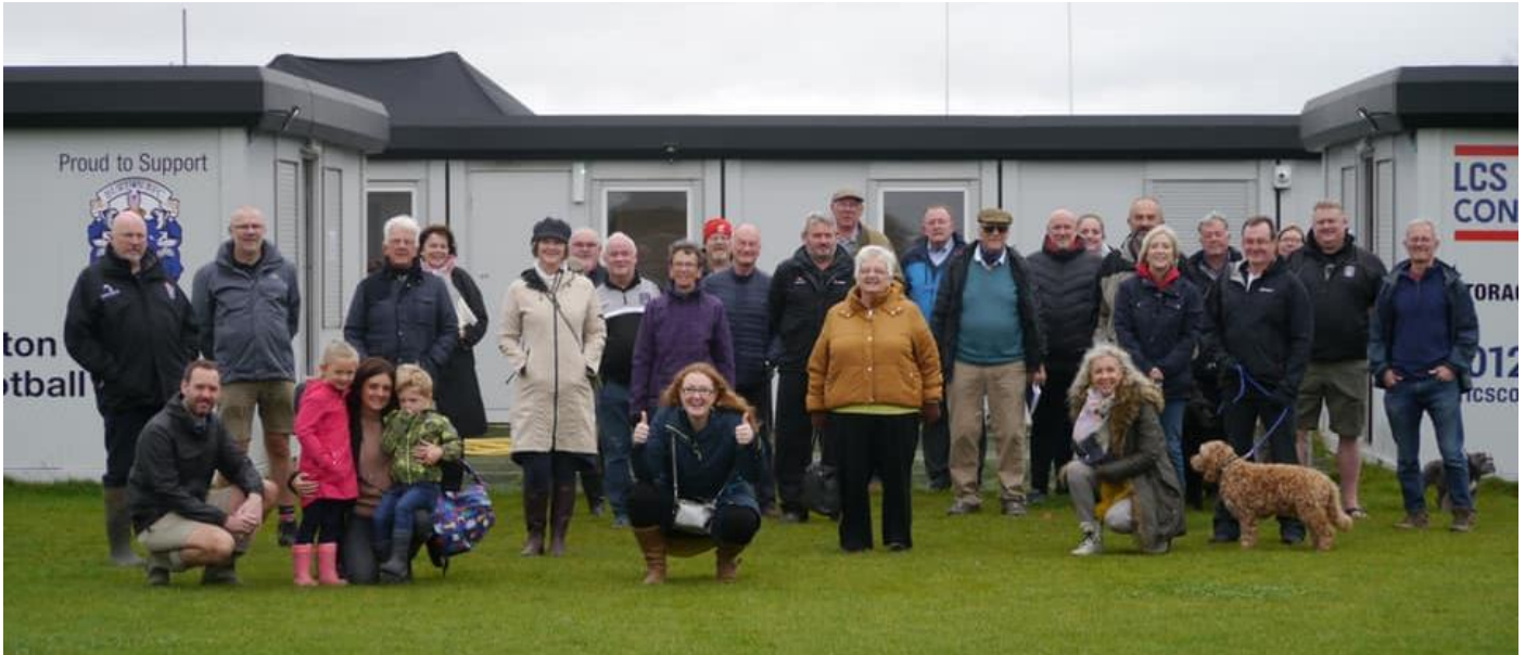
Sunday 4 October 2020 - Laps 74 and 75

All these characters and Alicadoos have contributed so much to what we have today in no small manner. If you would like to make a donation in their memory please go to my JustGiving page