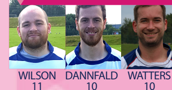
WILSON 11 DANNFALD 10 WATTERS 10