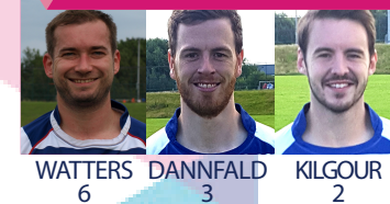
WATTERS 6 DANNFALD 3 KILGOUR 2