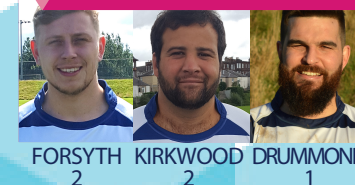
FORSYTH 2 KIRKWOOD 2 DRUMMOND 1