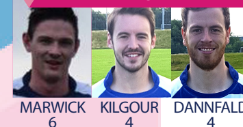
MARWICK 6 KILGOUR 4 DANNFALD 4