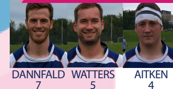
DANNFALD 7 WATTERS 5 AITKEN 4