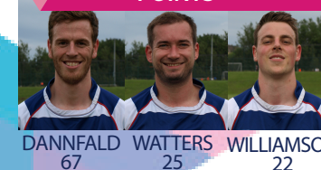
DANNFALD 67 WATTERS 25 WILLIAMSON 22