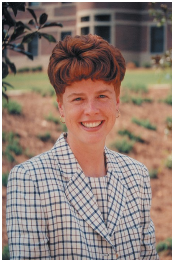
Jane Sixsmith MBE

Jane played hockey at club level for her hometown, Sutton Coldfield and took part in the 2013 Maxifuels Super Sixes indoor hockey finals with her team Sutton Coldfield.