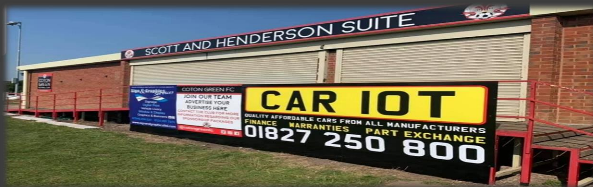
New Mill Lane Facilities in 2022