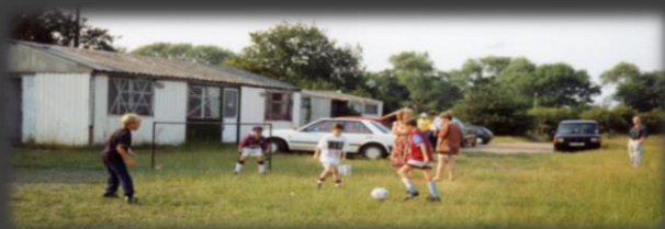
Changing Facilities at New Mill Lane in 1993