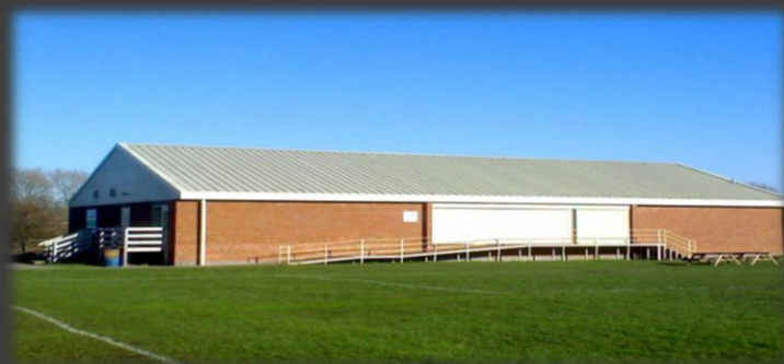
Newly built facilities that include changing rooms, meeting rooms, referees' room, storerooms, physio room, toilets, and bar/kitchen