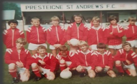
Original Green Army 1982