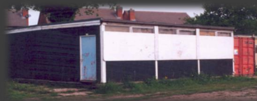
Temporary changing facilities

Our first pitch and home ground was Whittington Barracks up until 1988 when, due to an increase in team numbers, Dosthill Park became home to the Green Army for the next 5 years. In 1993, Coton moved to New Mill Lane, hiring the ground from Fazeley Swifts but sadly, in 1995, the changing rooms were burnt down, and Fazeley Swifts folded. Soon after this, the club agreed a 21-year lease with Fazeley Charity. Temporary changing facilities were built, and work began in and around New Mill Lane to improve the pitches and facilities with a vision to create the best privately owned junior football facilities in Tamworth.