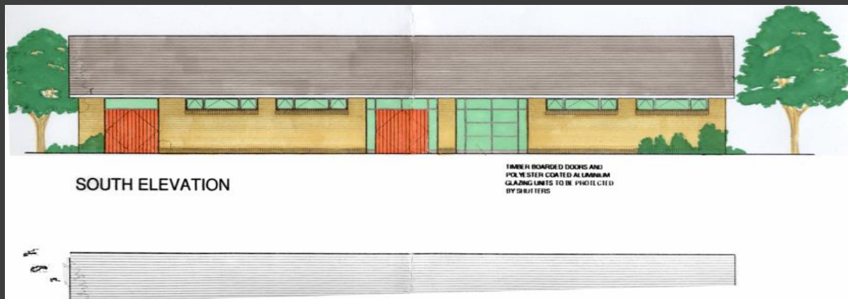
Initial design concepts