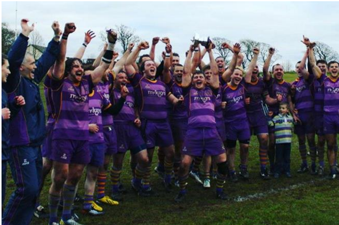
RBS West League Division 1 table