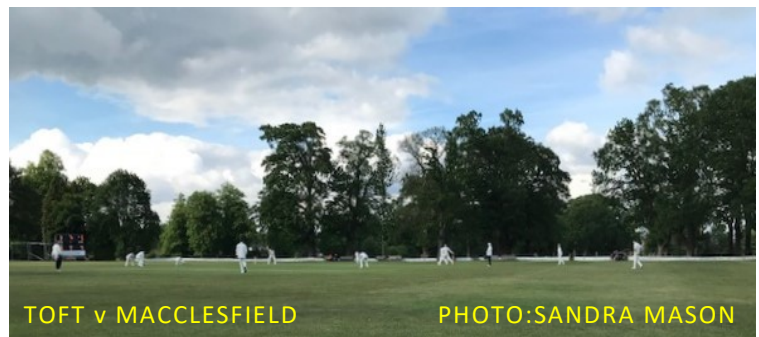
TOFT v MACCLESFIELD

Some highly watchable cricket has been played in the Cheshire Cup in 2019, with an intriguing set of games on May 19 producing many excellent performances. Perhaps the biggest plaudits will go to UKFast side Port Sunlight, who knocked out Grappenhall after their 219-7 at Broad Lane proved to be 27 too many for the Premier League side. The scorecard suggests a real team effort from Sunlight, who put aside poor league form to earn themselves a crack at near neighbours New Brighton in round two.