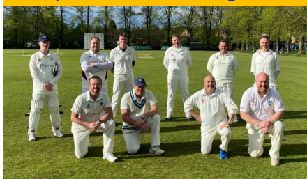
Macclesfield over 40's