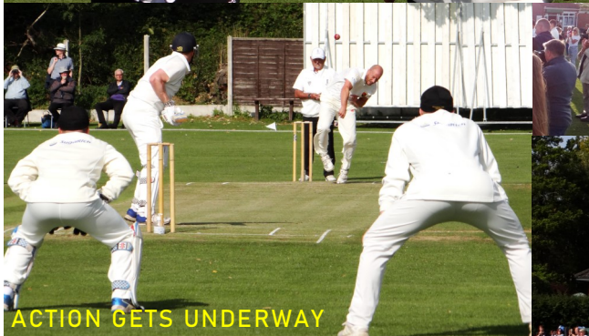
ACTION GETS UNDERWAY