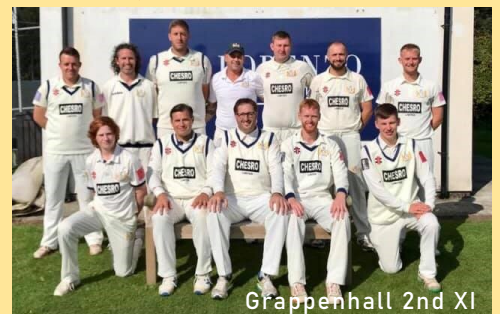
Grappenhall 2nd XI