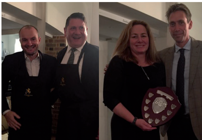
Little Chef, Big Chef - Your Friday evening BBQ hosts