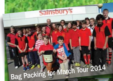
Bag Packing for March Tour 2014

NOTE: Worcester Hockey Club insurance does not cover personal accident. We advise players to take out their own each season.