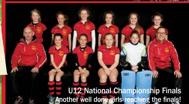
U12 National Championship Finals Another well done girls reaching the finals!