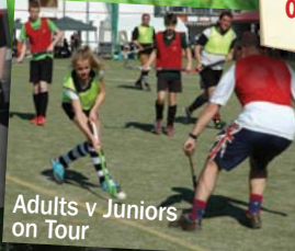
Adults v Juniors on Tour