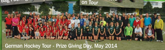
German Hockey Tour - Prize Giving Day, May 2014